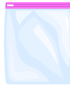
Zip Top Bag